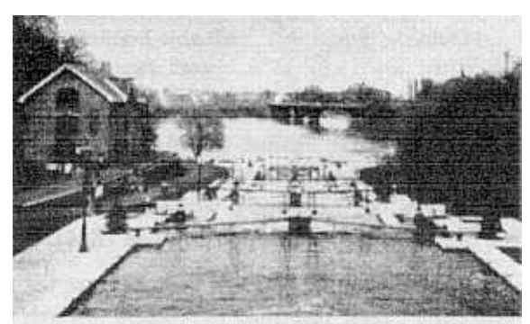
Looking north to the Rideau Canal entrance locks and the Ottawa River. The commissariat building, at left, is today the Bytown Museum.

On September 29, 1827 the Earl of Dalhousie laid the cornerstone, a block weighing nearly two tons, several feet under the level of the river on the east side of the Canal. The ceremony was performed inside a coffer-dam (a temporary dam which kept the river out of the work). The depth of water in sills is five feet with navigable depth of four and a half feet.